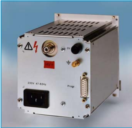
Rear side with mains connection, high voltage output and analog programming as a standard