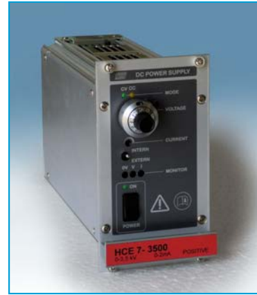
Optionally, the front plane can be equipped with a ten turn potentiometer for voltage adjustment.